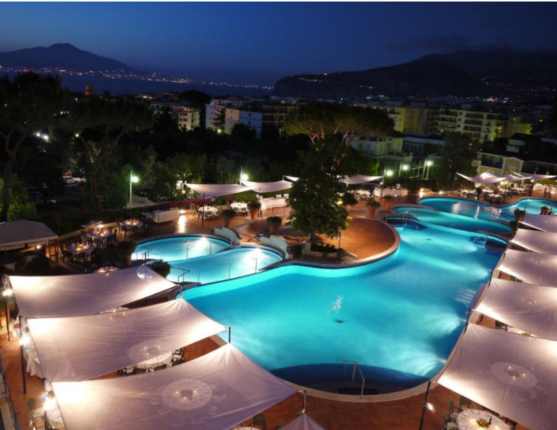
Outdoor Pool set up for a Cocktail Reception