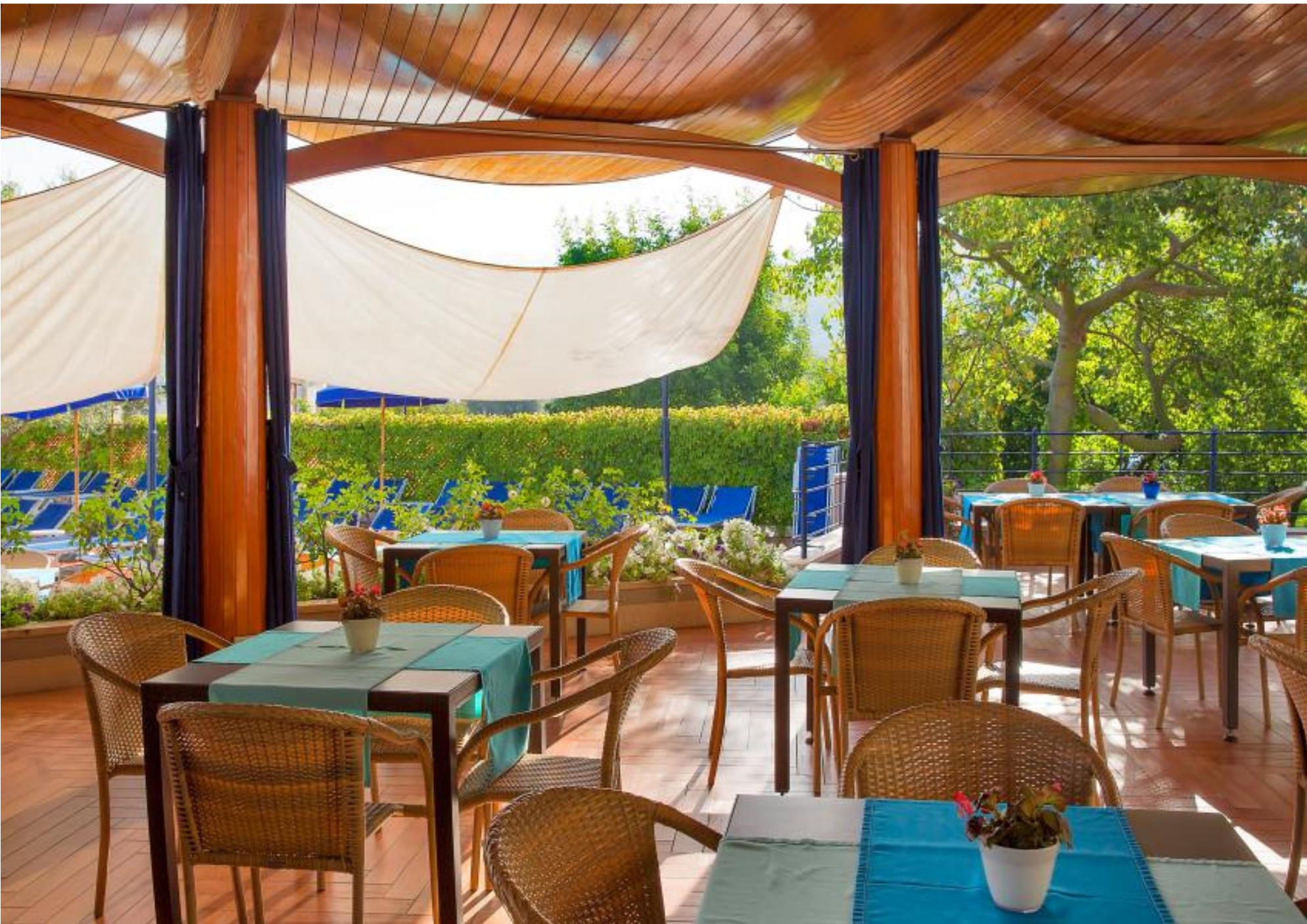
Pagoda Pool Bar