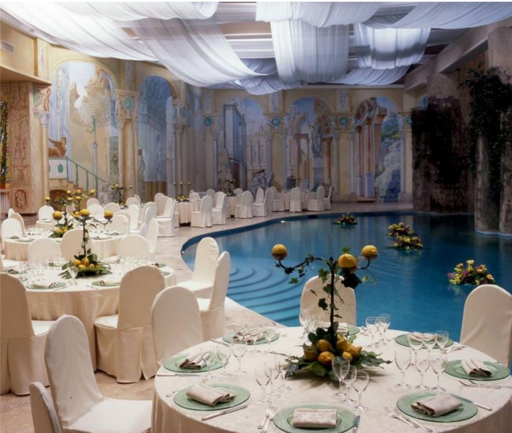
Sala Le Ginestre set up for a Gala Dinner