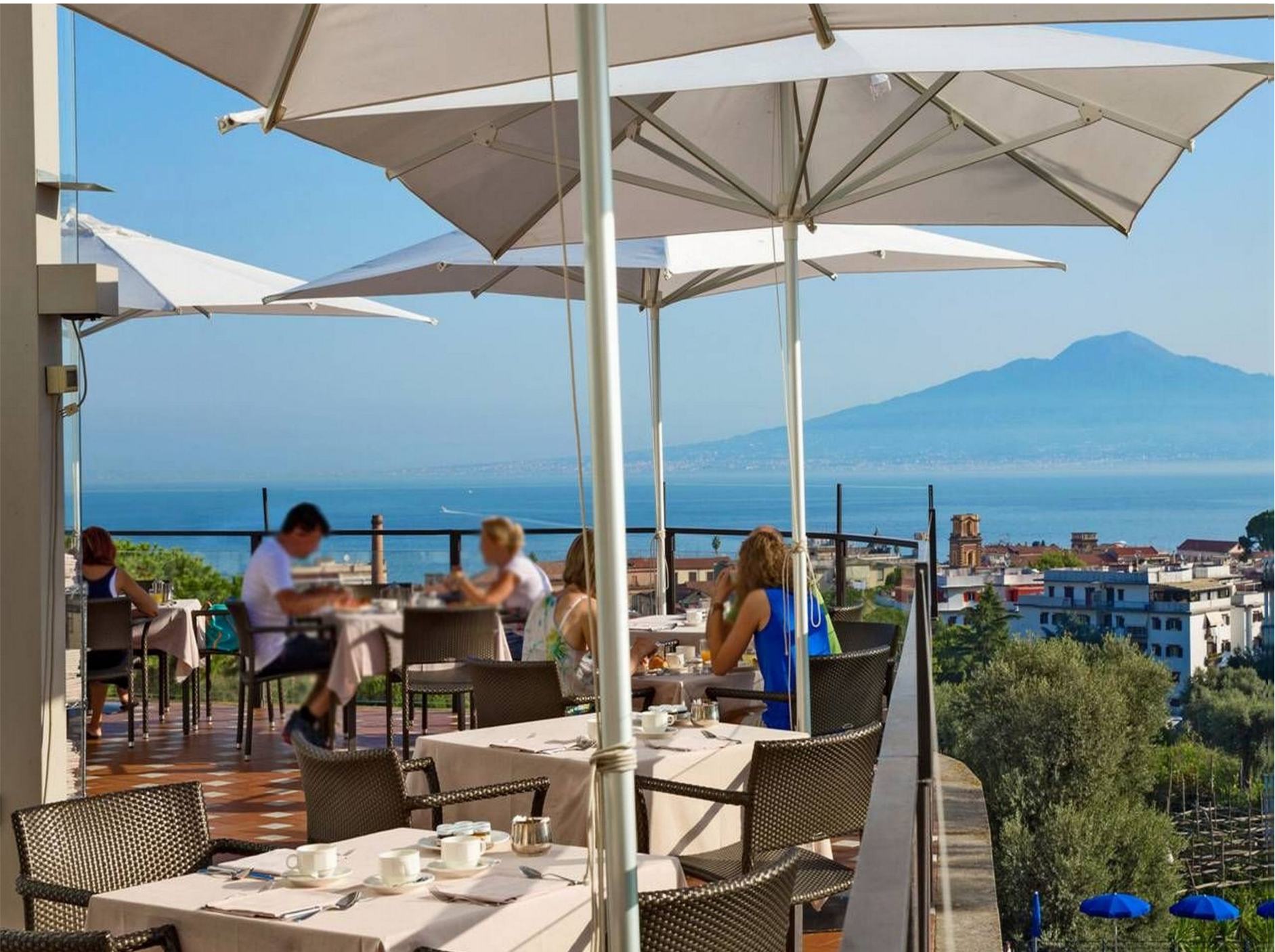
The stunning Terrace of the Sant' Antonio Breakfast Restaurant