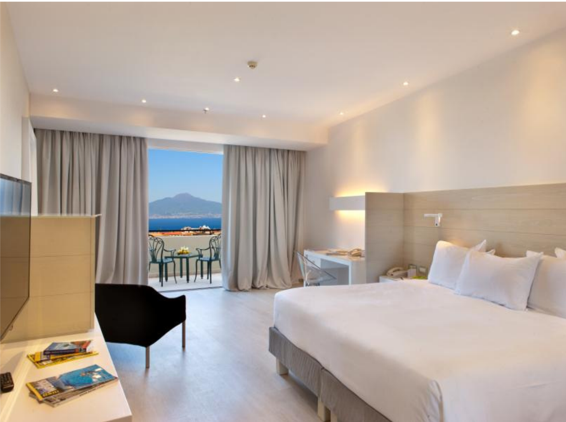
Newly renovated: 24 Deluxe Rooms Sea view